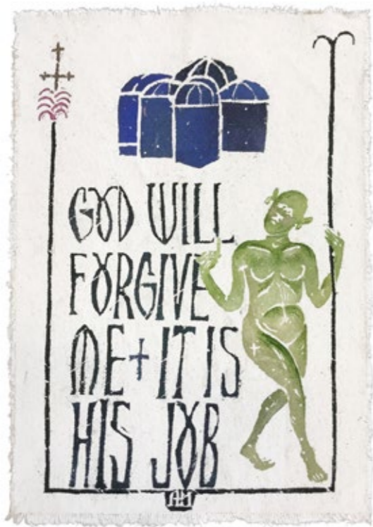
Blasphemous Witticism , 2019 Mixed media on canvas 29.7 x 21 cm 11 3/4 x 8 1/4 in. £800