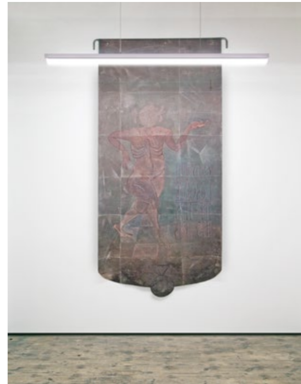
His Job , 2020 Oil and enamel paint on canvas 295 x 137 cm 116 1/4 x 54 in. £8,200