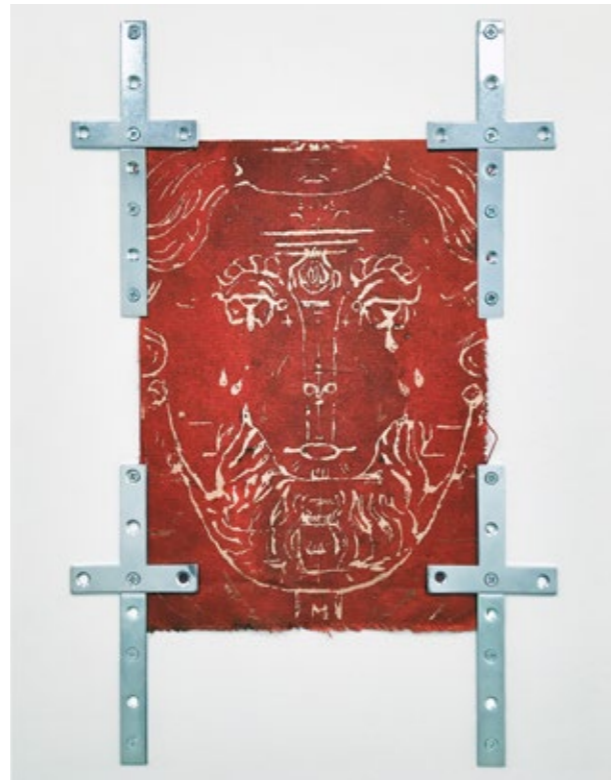
Untitled , 2019 Mixed media on canvas, steel 44.5 x 29 cm 17 1/2 x 11 1/2 in. £950