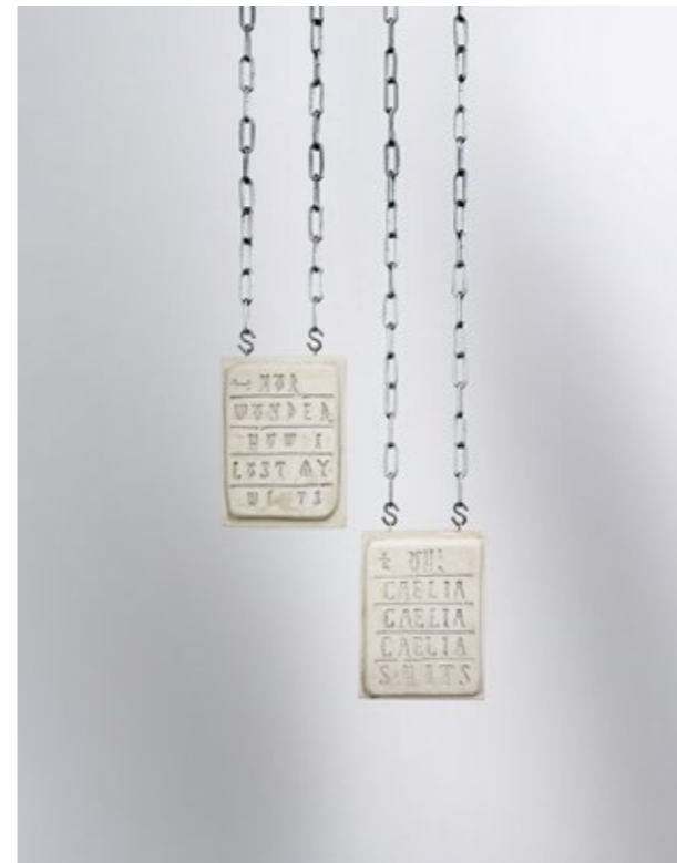
Caelia , 2020 Alpha plaster, wax, oil, steel 18.5 x 14 x 1.3 cm 7 1/4 x 5 1/2 x 1/2 in. £1,200