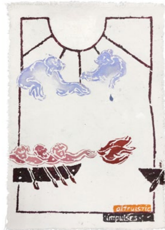
Altruistic Impulses , 2019 Mixed media on canvas 29.7 x 21 cm 11 3/4 x 8 1/4 in. £800