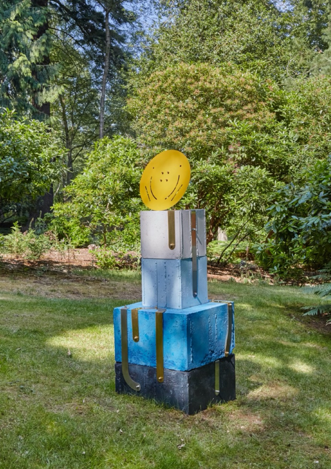
JACK WEST Yellow Sentinel , 2020 Painted laser cut steel, laser cut stainless steel, laser cut brass, bolts, dyed concrete 160 x 55 x 55 cm 63 x 22 x 22 in.