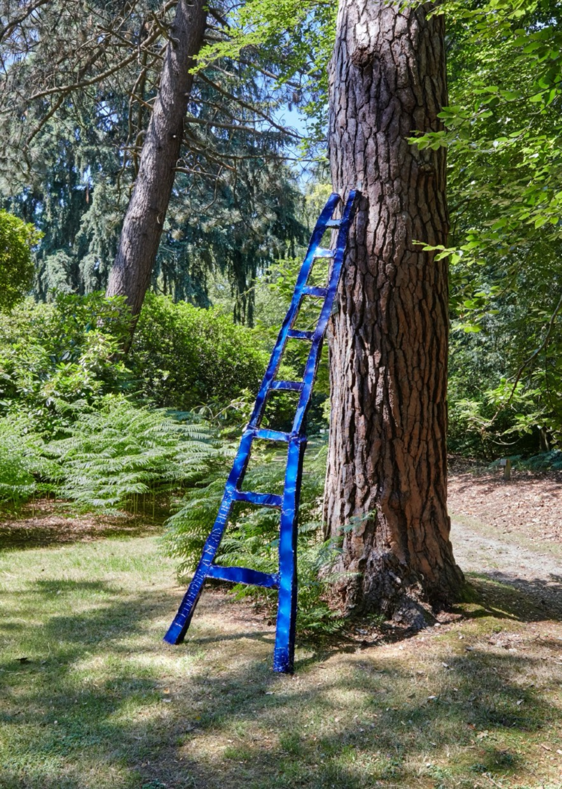
JESSE POLLOCK Flogging a Dead Horse, 2020 Powder coated steel 300 x 100 x 6 cm 119 x 40 x 2 1/2 in.