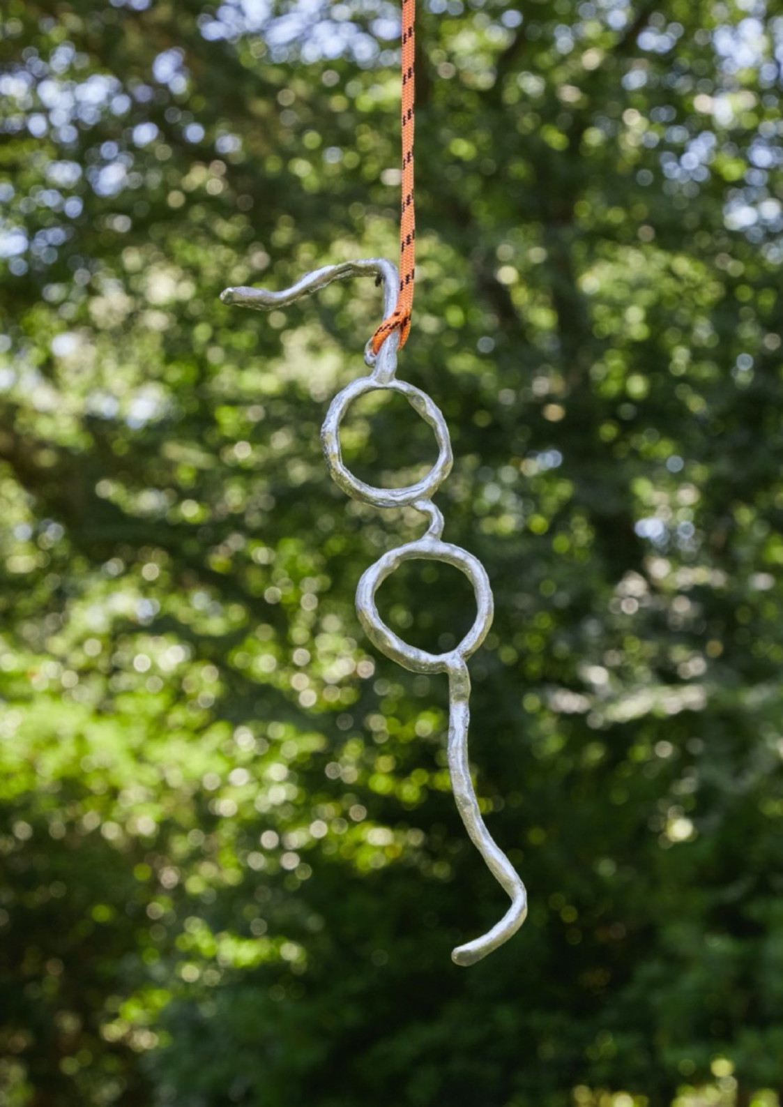
JEMMA EGAN Twenty Twenty , 2020 Cast pewter, polyester rope 45 x 12 x 4 cm (5m length rope) 17 3/4 x 4 3/4 x 2 in. Variable Edition of 8