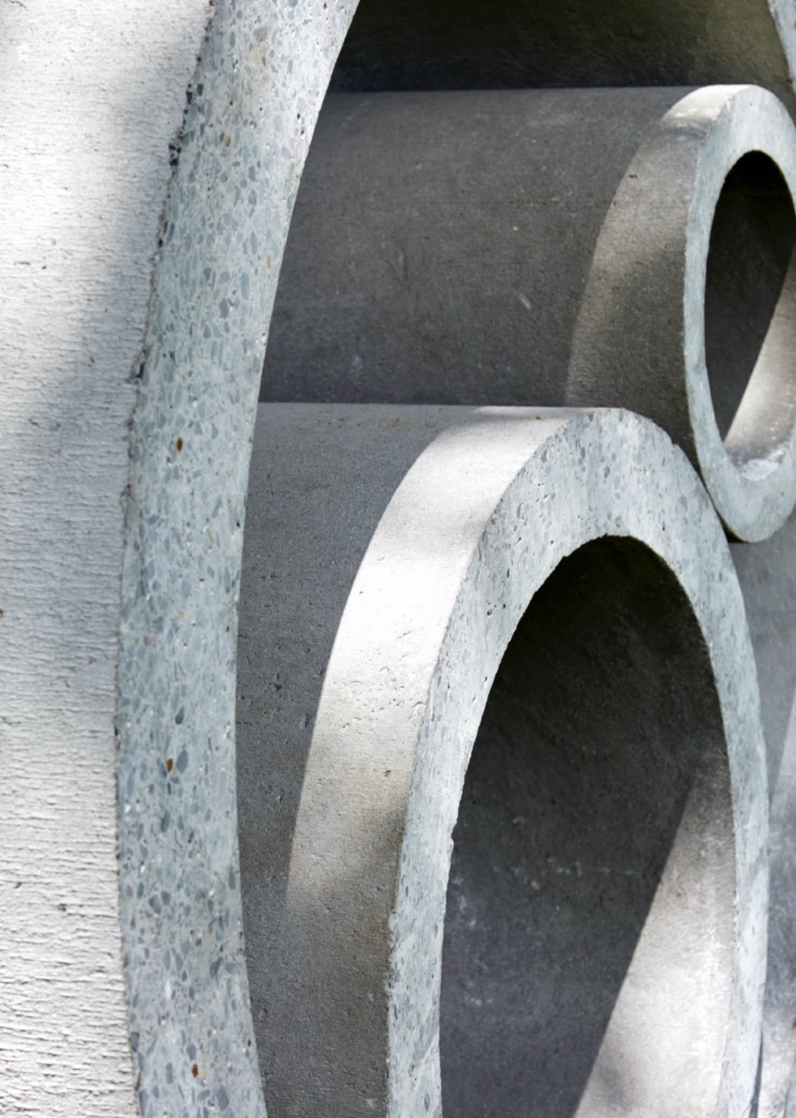
ALEXANDRE DA CUNHA Public Sculpture (Pouff VII) , 2018 Concrete 172 x 172 x 49 cm 68 x 68 x 20 in.