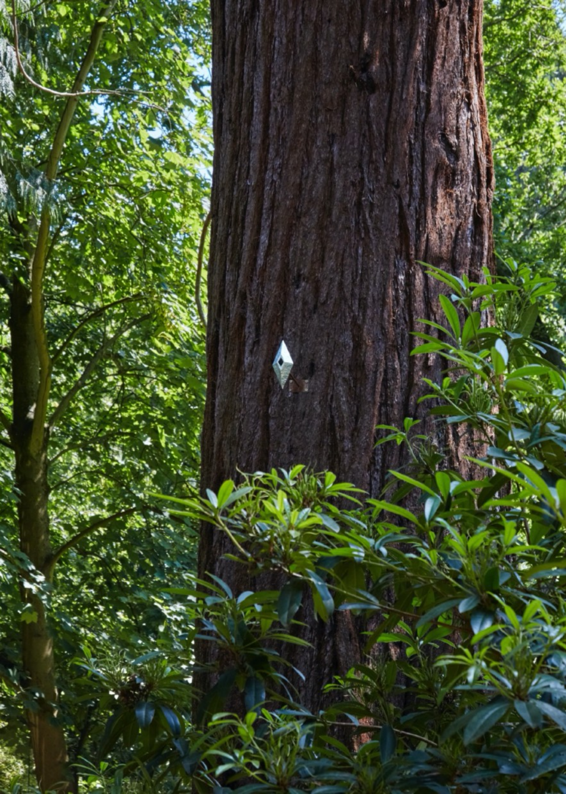
VICTOR SEAWARD Diamond Nest , 2020 Silver leaf on 3D printed ASA 20 x 9 x 9 cm 8 x 3 1/2 x 3 1/2 in.