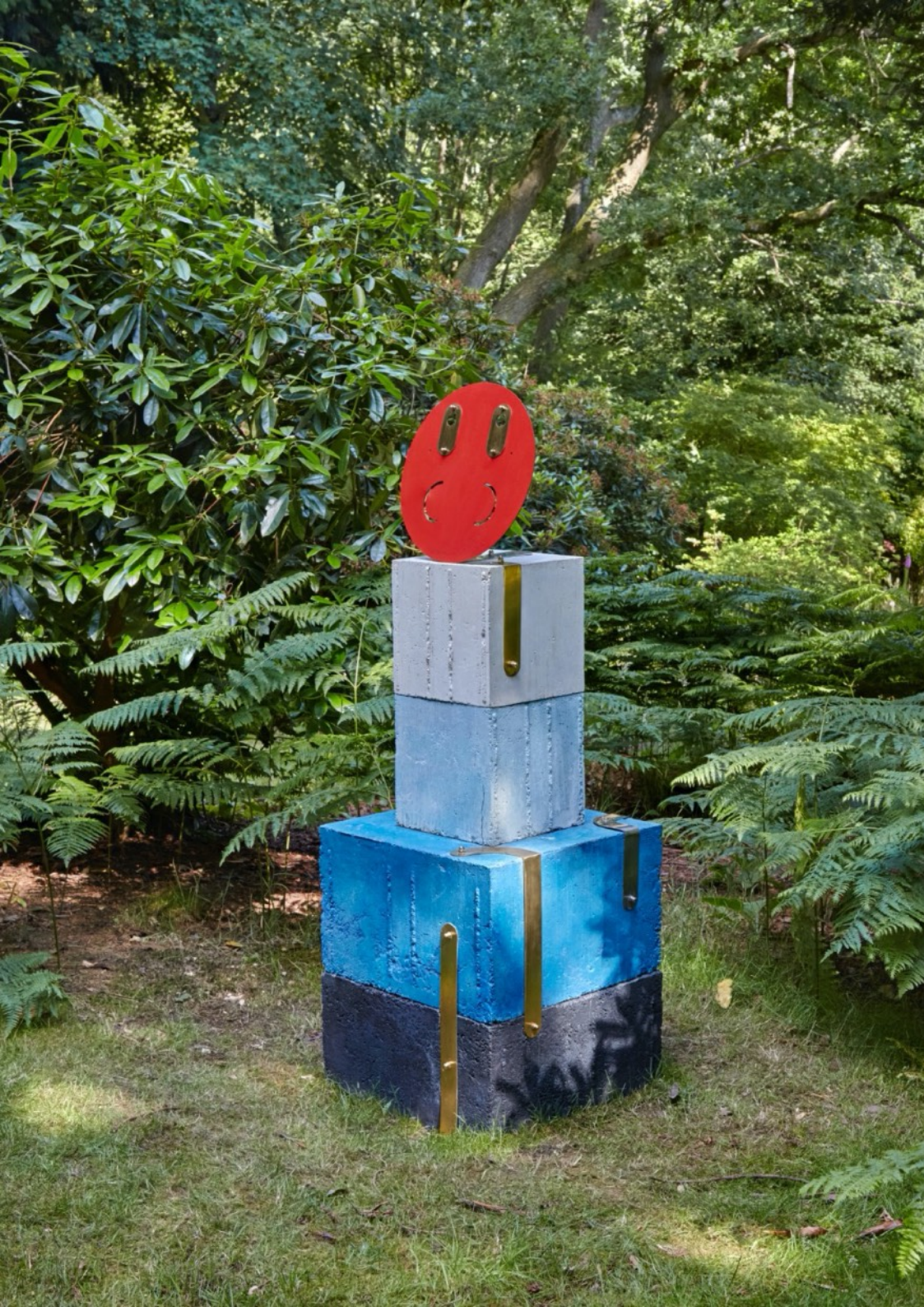
JACK WEST Red Sentinel , 2020 Painted laser cut steel, laser cut stainless steel, laser cut brass, bolts, dyed concrete 160 x 55 x 55 cm 63 x 22 x 22 in.