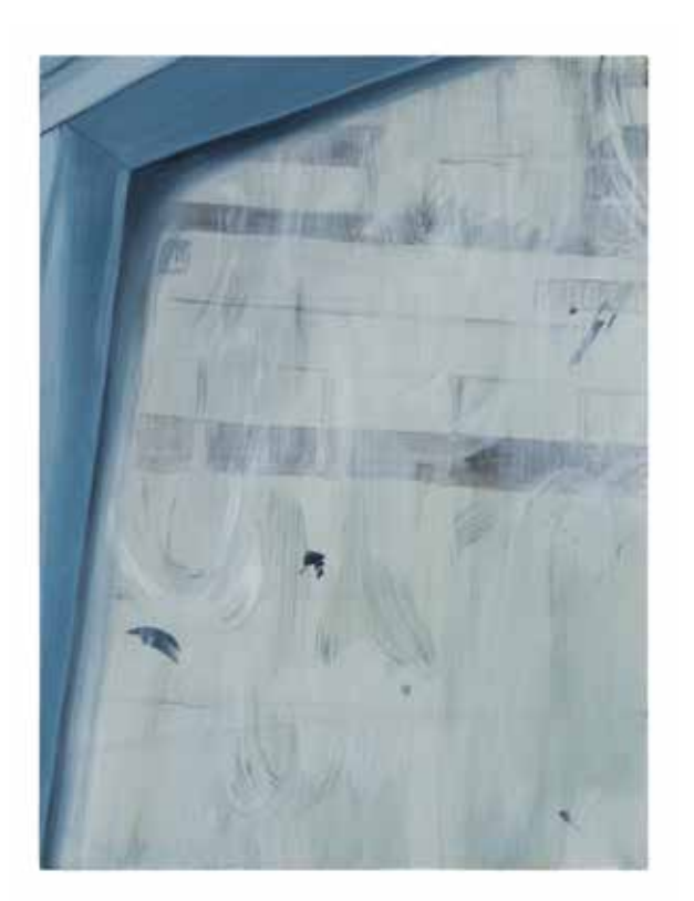
Whitewash, 2020 Oil on panel 40.6 x 30.5 cm 16 x 12 in. Unique

Evening Light, 2019 Oil on canvas 33 x 40.6 cm 13 x 16 in. Unique