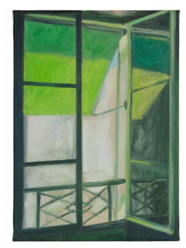
Green Window, 2020 Oil on canvas 45.7 x 33 cm 18 x 13 in. Unique