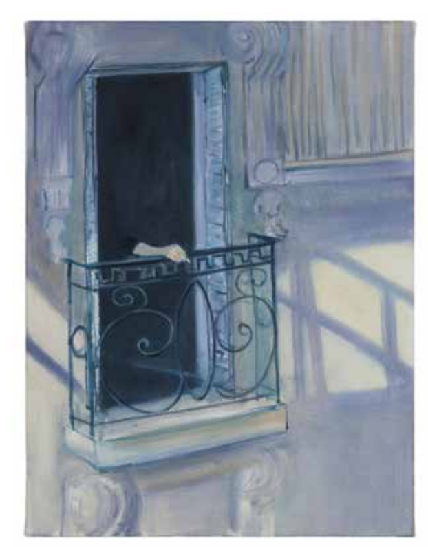
Cigarette Break, 2019 Oil on canvas 61 x 46.1 cm 24 x 18 1/4 in. Unique