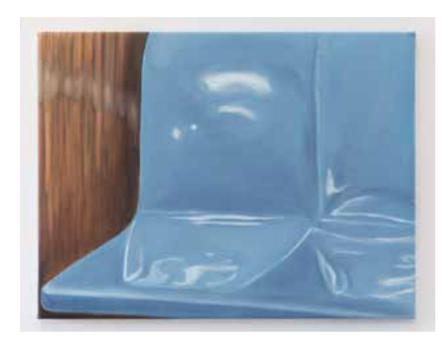
Blue R Train, 2017 Oil on canvas 45.7 x 61 cm 18 x 24 in. Unique