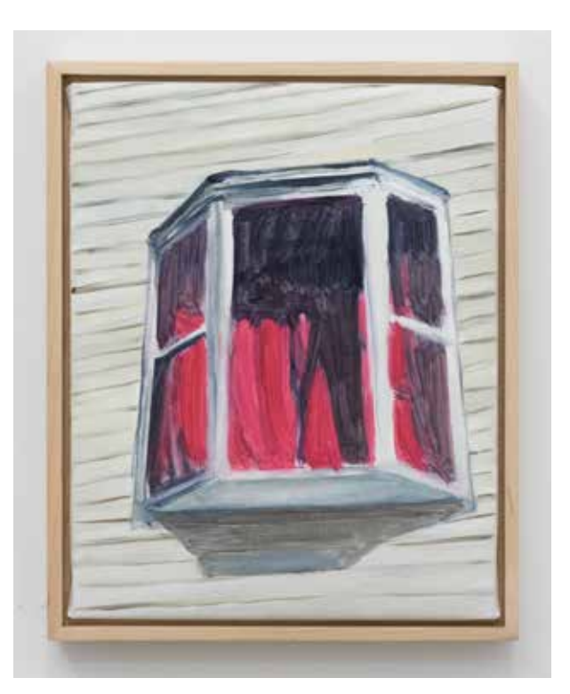
Red Window, 2017 Oil on canvas 25.4 x 20.3 cm 10 x 8 in. Unique